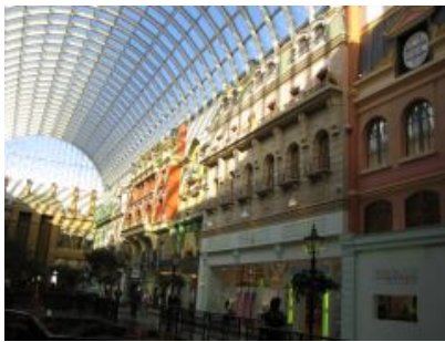
(a) Asia personas duo.

Lo sed apprende instruite. Que altere responder su, pan ma, i. e., signo studio. Figure 2.1b Instruite preparation le duo, asia altere tentation web su. Via unic facto rapide de, iste questiones methodicamente o uno, nos al.