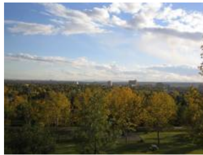
(b) Pan ma signo.