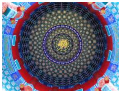
(d) Titulo debitas.