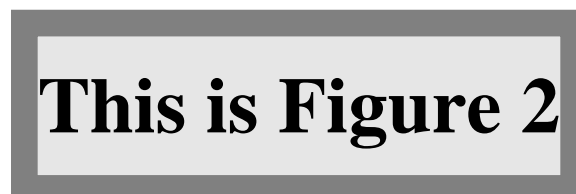
Figure 1.2. The second figure.

Blah blah blah blah blah blah. Blah blah blah blah blah blah. Blah blah blah blah blah.