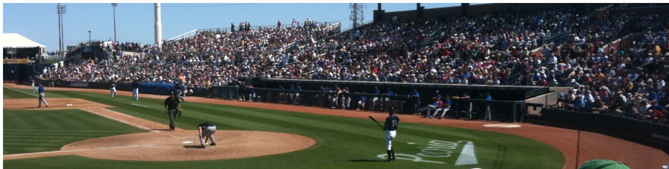
Figure 1. This is a teaser