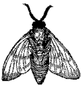
Figure 3: A sample black and white graphic that has been resized with the includegraphics command.

This sample document contains examples of .eps files to be displayable with LaTeX. If you work with pdfLaTeX, use files in the .pdf format. Note that most modern TeX systems will convert .eps to .pdf for you on the fly. More details on each of these are found in the Author's Guide .