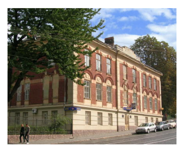
Figure 2. This is a sample of a bitmap image. This cosy building homes the Institute for Condensed Matter Physics and the CMP Editorial Office too.

Roughly speaking, there are two types of electronic figures: vector graphics and bitmap graphics. A vector image is a set of arranged objects: lines, polygons, ellipses, shades, characters, etc. Such an image allows almost arbitrary scaling without loss of quality. Vector images are typically charts, plots, diagrams, etc., produced by various computer software. A bitmap image is a two-dimensional array of pixels (PICture'S ELements) or "dots". Continuous tone photographs are their the most widespread samples (like figure 2). Image quality is determined by DPI (Dot Per Inch — a pretty self-explained definition). Below, there are necessary requirements for each type of images.